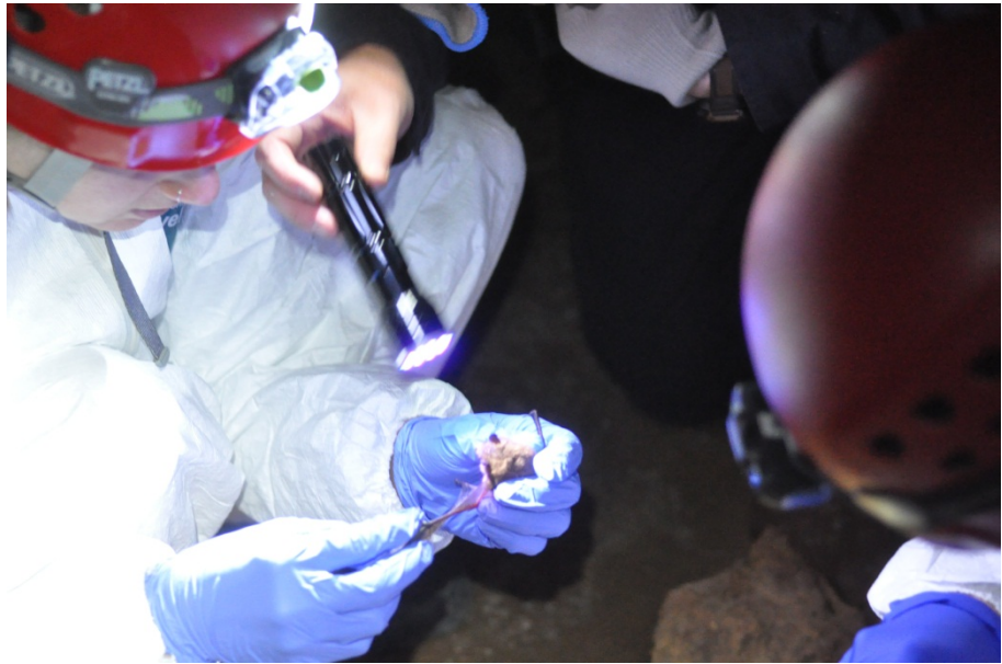
Figure 1: UT and TWRA use UV to look for WNS

The 2011-2012 winter hibernacula surveys were conducted between January 10, 2012 and April 14, 2012. The surveys were purposefully scheduled later in the season to allow for the development of WNS symptoms which seemed to appear later during the 2009-2010 hibernation season. Since this was not a census year for either of our two endangered species, the majority of surveys performed were expressly designed to monitor the state