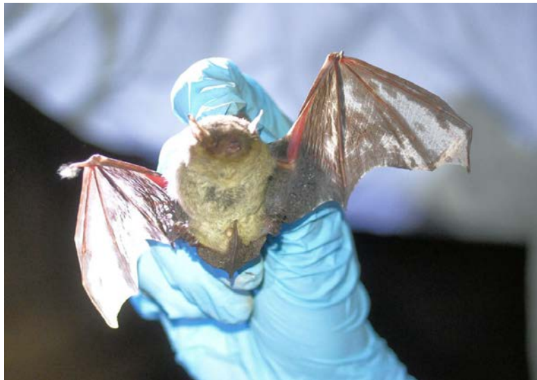
Figure 4: Gray bat in Bellamy Cave showing wing damage

In all, the number of confirmed WNS+ counties in Tennessee doubled between 2011 and 2012. Several new sites were confirmed through laboratory analysis, and bats at some sites in already confirmed counties were observed to have field signs consistent with WNS. In an effort to reduce the number of euthanized bats, surveyors did not submit bats from sites in previously confirmed WNS+ counties. One exception is the Bellamy Cave case, in which the disease affected a species not previously known to be susceptible to WNS.