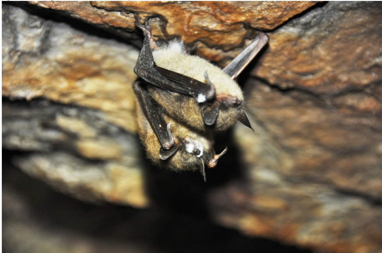
Figure 5: Field signs of WNS from Tobaccoport Saltpeter Cave